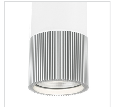
optional downlight (detail)

*delivered lumens based on 4000K, 90 cri